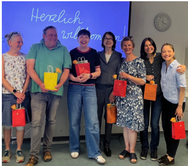
VHS-Lehrkräfte der Integrationskurse in Göttingen